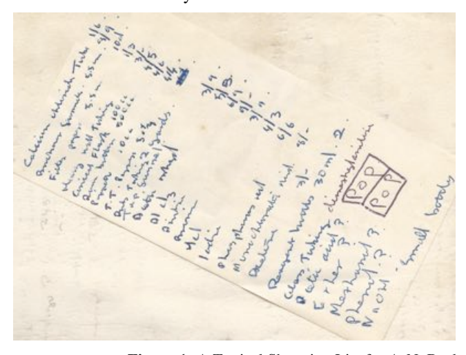
Figure 1: A Typical Shopping List for A.N. Beck.

away from where we lived in southeast London, but I happily ventured on my own on the 72 bus and started returning not only with a new batch of chemicals (figure 1) but also the glassware needed to perform "proper" experiments. Imagine my delight when I got a water pump and was able to do reduced pressure distillations. All this in a small (unventilated) annex to the kitchen in the house, the use of which my parents just about tolerated. At least until the day that I mixed ethanol with a mixture of sulfuric and nitric acids and sprayed a rather nice Jackson Pollock brown pattern onto the kitchen ceiling. My punishment for doing this was learning how to repaint the ceiling - I have been none too fond of painting ceilings ever since. I was now able to explore a few more of the compounds mentioned in the Mellor text, which I continued to absorb avidly. But soon I realised that there was much more to chemistry than described in Mellor.